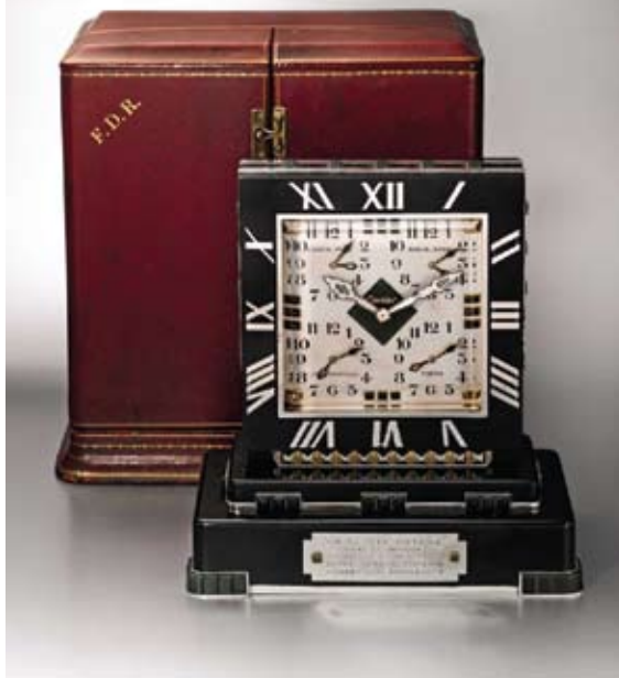
Cartier, The Franklin Delano Roosevelt Cartier Victory Clock, 1943, a silver, onyx and nephrite eight-day, five time zone desk timepiece presented to President Franklin Delano Roosevelt by Pierre Cartier on December 20th, 1943. To be sold in at Sotheby's New York on December 4th, 2007.