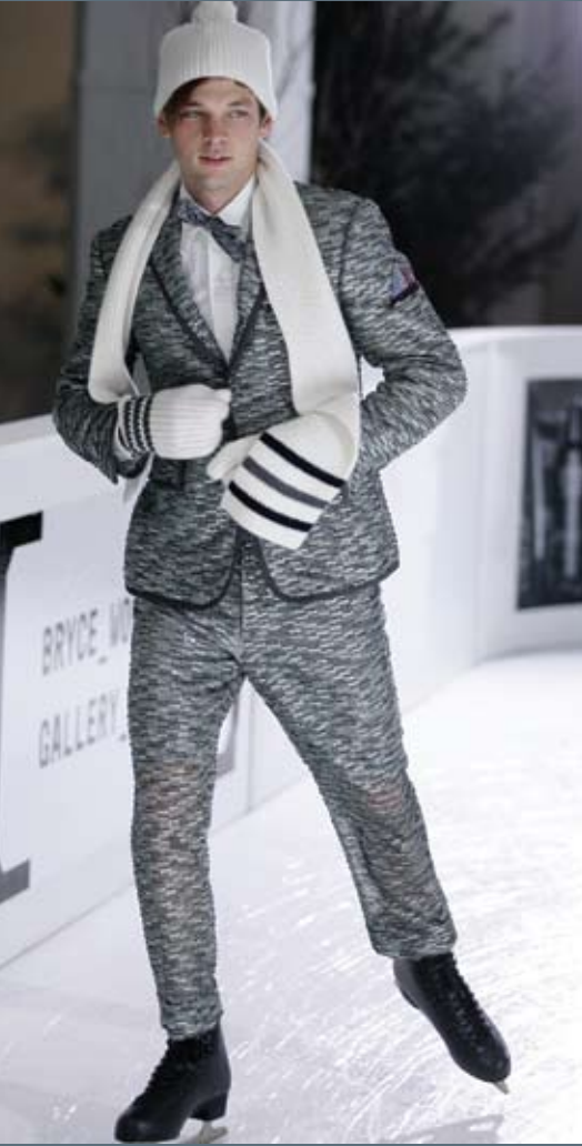
Thom Browne, Men's Suit, Autumn/Winter 2006-2007

Thursday – Saturday, November 29 – December 1, 2007