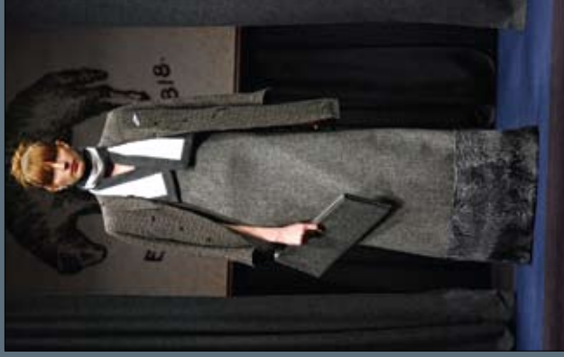
Thom Browne for Brooks Brothers Black Fleece, Woman's ensemble , Fall 2007