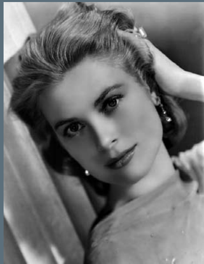
Grace Kelly, in High Society, 1956, director: Charles Walters; studio: Metro-Goldwyn-Mayer