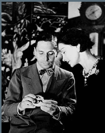
Verdura Showing his Cuff bracelet to Chanel, c. 1935