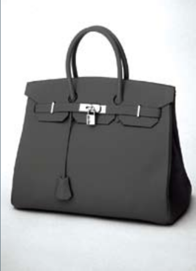
Hermès, Leather Birkin Bag, designed in 1984 and named for Jane Birkin