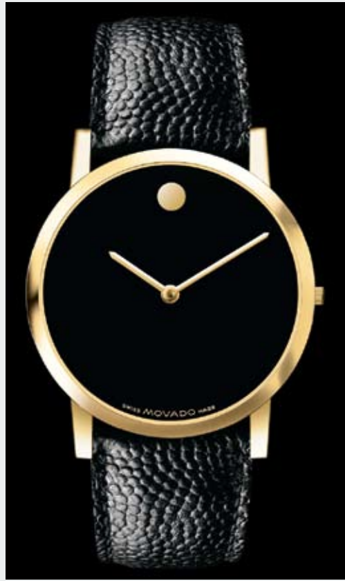
MOVADO, timepiece featuring the single dot Museum Dial, an icon of modern design, which celebrates its 60th anniversary; photo: MOVADO.