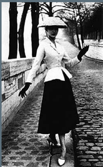
Christian Dior, "The Bar Suit", from the "The New Look," 1947