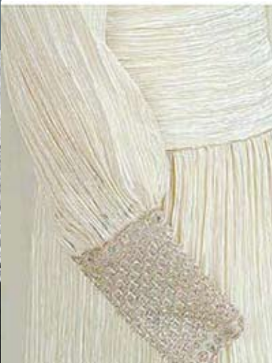
Mary McFadden, Wedding Dress Detail , with "Fortuny" pleating, gold thread embroidery, pearl/jewel-toned beadwork cuff. In collection of and photo: Historic Fashion Collection. Stephens College, Columbia, MO.