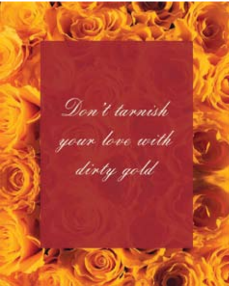
No Dirty Gold Valentine (detail); Image, Courtesy: EARTHWORKS and No Dirty Gold Campaign.

The day's formal sessions will take place at The Graduate Center, The City University of New York 365 Fifth Avenue (at 34th Street).