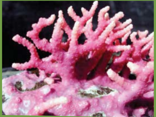
Vibrant Living Corals & Reefs, Bright Pink Stylasterid Coral, Stylaster venustus ; Photo: ©Alberto Lindner/NOAA; Courtesy: SeaWeb.