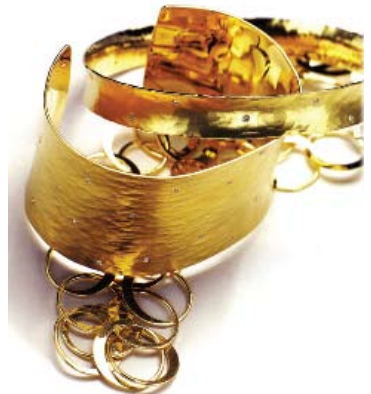
Toby Pomeroy, Jewelry of EcoGold with Conflict-Free Diamonds; Photo: basilphoto.com which appeared in JCK Luxury (Summer 2008).