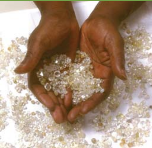
Diamond Rough in Hands

Thursday, Friday, and Saturday, December 4 – 6, 2008