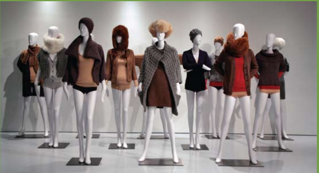
Lutz & Patmos / Fall 2008 Collection / NEW MUSEUM / FEBRUARY 3, 2008

We also express our gratitude to Aaron Faber Gallery, Macy's, Harry Winston, Kaleidoscope Consulting, and The Louis and Lena Minkoff Foundation for their support (as of 10/23/2008).