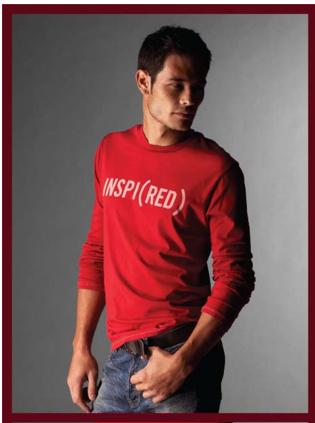
Gap (PRODUCT) RED, Men's Long Sleeved INSPI(RED) T