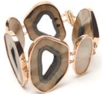
Monique Péan, Fossilized Walrus Ivory Bracelet with 18-carat Recycled Rose Gold; Photo, Courtesy: Monique Péan, LLC.