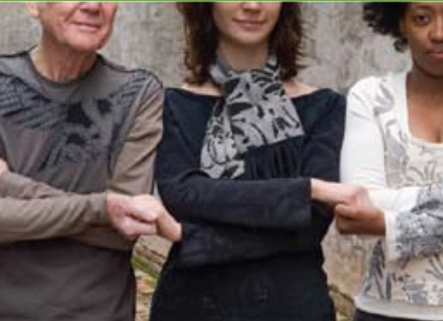
Clothing by Alabama Chanin, Revolution Fall/Winter 2008