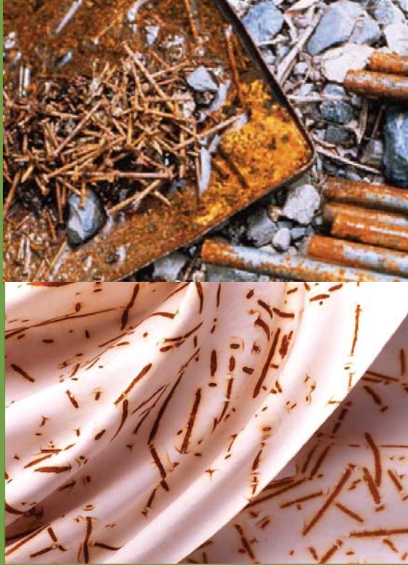
Reiko Sudo, Scrapyard (accompanied by photo of source for print on rust-dyed textile), various contents; Photo, Courtesy: Nuno Corporation and Material Things.

Initiatives in Art and Culture 333 East 57th Street, Suite 13B New York, New York 10022