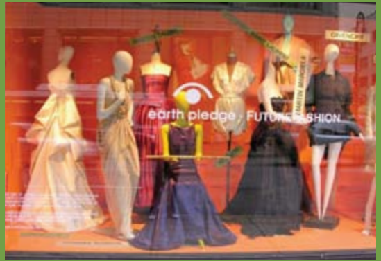
Barneys New York Window Featuring Looks from Earth Pledge FutureFashion Show, Fashion Week February 2008 ; Photo, Courtesy: Barneys New York.