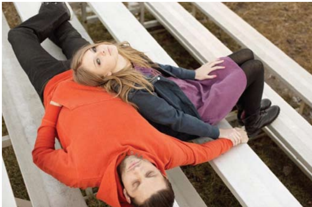
Loomstate, Men's and Women's Look , Fall 2008; Photo: Loomstate.

production, Mackinlay Hahn and Gregory — both committed environmentalists — became aware of the toxic effects of conventionally grown cotton. As a result, they launched a clothing line made of 100% organic cotton, and pledged to promote sustainable agriculture. In the Fall of 2004, Loomstate launched its first collection. Loomstate creates clothing inspired by classic American casual style, tailored in keeping with contemporary taste, and rendered with attention to detail in the highest quality 100% certified organic and environmentally