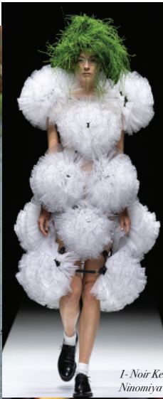
1- Noir Kei Ninomiya