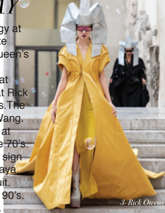
3- Rick Owens

Re-make history. Greek mythology at Mary Katrantzou. Marie Antoinette redux at Loewe. Alexander McQueen's romantic heroines. Comme des Garçon's revivalist art. Panniers at Thom Brown. Aztec princesses at Rick Owens. Mining the past: The 60's. The Mods look modern again. Vera Wang. YSL's le smoking is still smoking at Saint Laurent, Ralph Lauren. The 70's. Women wear the pants. The first sign of sexual equality. TommyXZendaya. The 80's. Shouldering the pantsuit. Giorgio Armani. Balenciaga. The 90's. Recalling minimalism. Jil Sander.