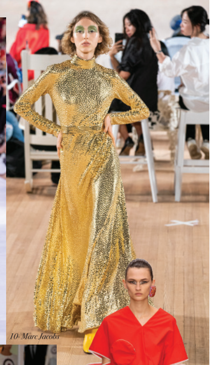
10- Marc Jacobs