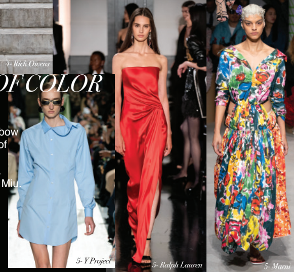
5- Y Project

Republican Red. Ralph Lauren. Democrat Blue. Y Project. Sunny, happy yellow. Rick Owens. A rainbow coalition. Marni. Pantones. Pops of neon colors. Valentino. The new neutrals: Tom Ford. White is right. Valentino. McQueen. Loewe. Miu Miu.