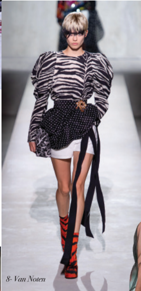
8- Van Noten

Shorts, from hotpants at Hermes to Bermudas at Givenchy, are to thigh over. Short suits are the new pantsuits. Chanel. Van Noten/ Lacroix. Chloe. Saint Laurent. Mugler. Minis are "everywhere", notably at Chanel. Vuitton.Saint Laurent.