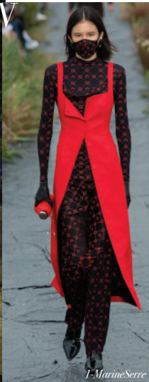
1- Marine Serre