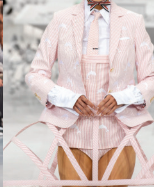
10- Thom Browne