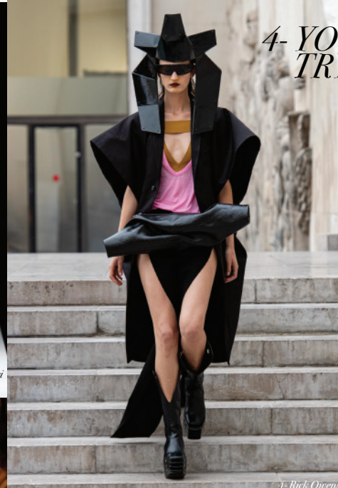
4- Rick Owens