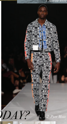
2- Pyer Moss

Fashion's antidote to angst. Joie de Vivre on the catwalk. Smiling models. Theia. "Sensible" clothes. Individuality. Gender Fluidity. Pyer Moss. A new more wearable minimalism. Tory Burch. The street detours into a path for the bourgeoisie. Givenchy. New status for the status quo. Marc Jacobs. Prada. Lacoste. Hermes. Understatement is the new fashion statement.