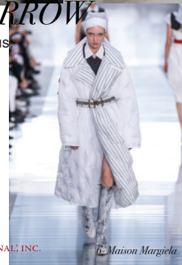
6- Maison Margiela