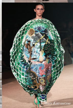
3- Mary Katrantzou